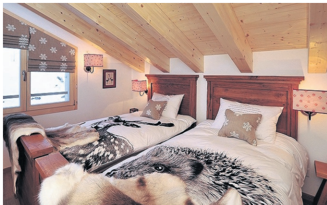
DESIGN AT THE DOUBLE The twins' bedroom fits the chalet theme